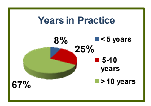
Figure 2 shows distribution of gynecologists by years of practice.