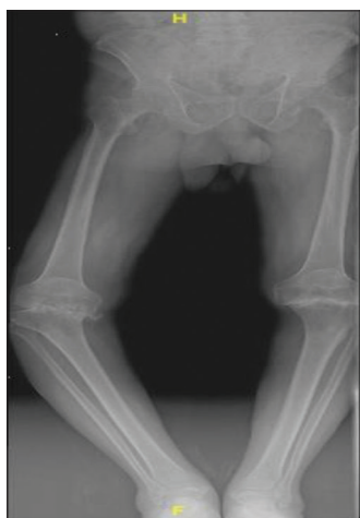
Figure 2: Full-length lower limb centigram upon initial presentation