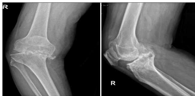
Figure 1: Severe degenerative changes Anteroposterior view (left side) and Lateral view (right side) of the right knee upon initial presentation

In the context of treatment, the treatment of choice is resection, using either an open technique or arthroscopy; the local recurrence can reach up to 56% in the diffuse form. [4] The reason behind the recurrence, as suggested