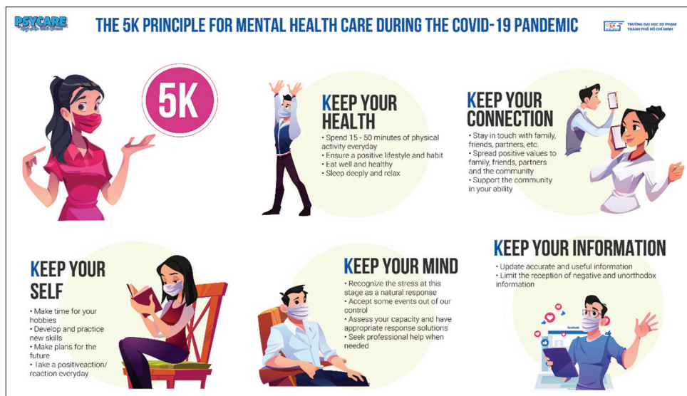
Figure 2: Handbook of mental health care during the COVID-19 outbreak

Regarding the type of consultations, 876 cases were related to general inquiries about mental health or requests for