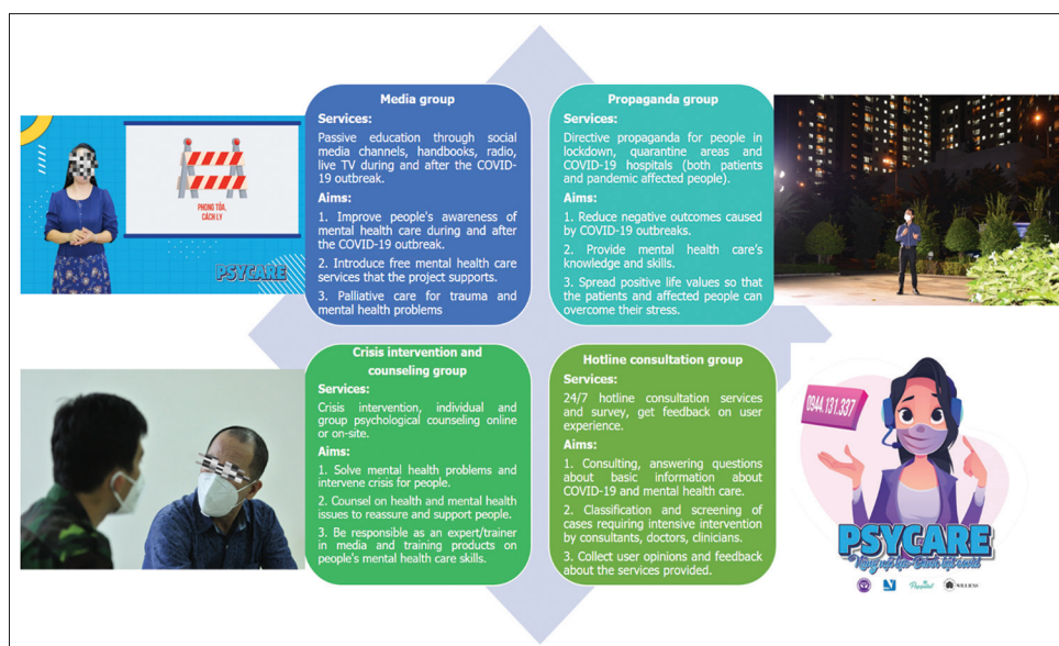
Figure 1: COVID-19 Crisis Palliative and Mental Health Care Model

It was evident that our framework and project were proven feasible and thriving in the provision of MHC assistance to Vietnamese people who were affected or infected with COVID-19, including the children, adults, vulnerable people,