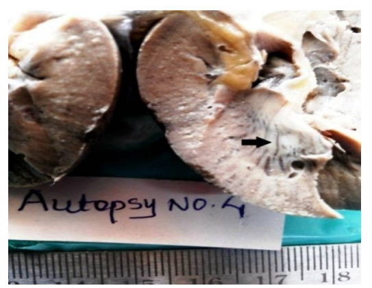
Figure 1 arrow showing whitish nodule in the medullaryregion of the kidney.

The other autopsy findings were focal cerebral microhaemorrhages and bronchopneumonia. The uterus showed acute on chronic nonspecific deciduaitis and myometritis. Heart, spleen, pancreas and gastrointestinal tract showed no specific lesion.