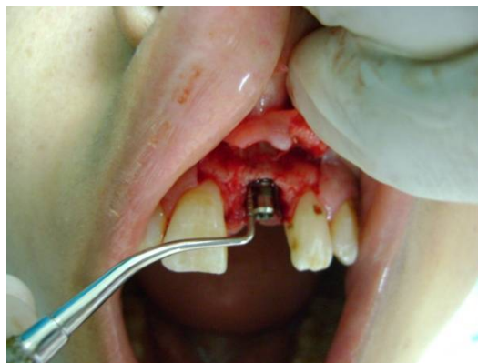
Fig. (2): the one-piece implant placed in the extraction socket.

All patients were operated upon under local anesthesia using infra-orbital nerve block supplemented with infiltration of the interlacing fibers. A full thickness mucoperiosteal flap was reflected. The tooth was extracted with minimal trauma to preserve the cortical bone. Then the socket was curetted and filed to remove any infected or inflammatory tissues as well as remnants of periodontal ligament. Socket shaping and deepening was accomplished with appropriate sizing drills, so that maximum lateral contact could be achieved with the placed Implant body. Drilling was done 3 to 4 mm beyond the apex so that the implant would be anchored in healthy bone beyond the bottom of the socket. The appropriate length and width of the one piece Zimmer implant was selected and placed in the extraction socket (Fig.2). The alloplastic material (bone graft) was placed in osseous defects after implant placement around the implant. Then the membrane was trimmed and placed over the bone graft (Fig.3), and secured under the flap then, it was sutured using 000 silk sutures. The implant was then immediately restored with a provisional crown that was freed from occlusion. Final impression was taken using rubber base impression material and a permanent crown was placed six weeks later (loading was done after six weeks from implantation).