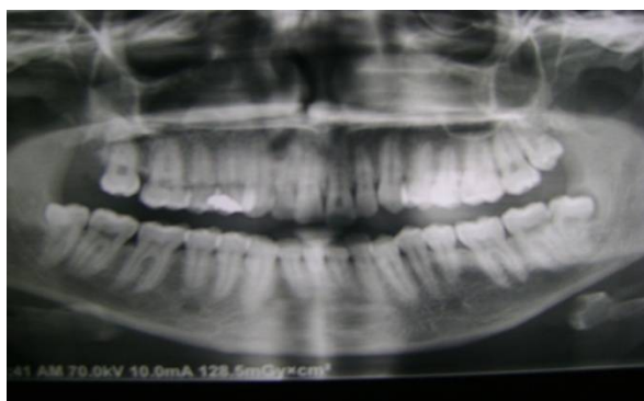
Fig. (1): Pre-operative panoramic view for the maxillary left central incisor with horizontally broken root due to trauma.

Image j*: 1.31 Public Domain Software, downloaded through the internet from National Institute of Health, USA.