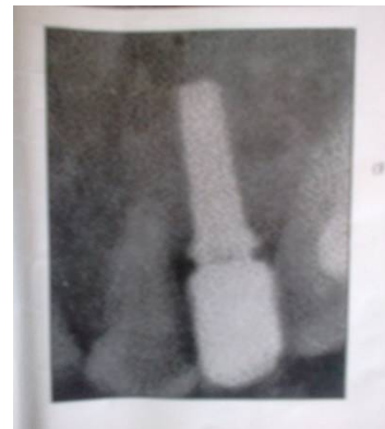
Fig (5): Periapical radiograph after fourteen months from implant placement.