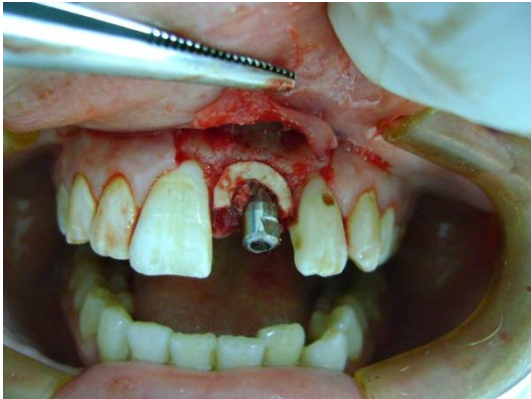
Fig. (3): Alloderm membrane around implant.