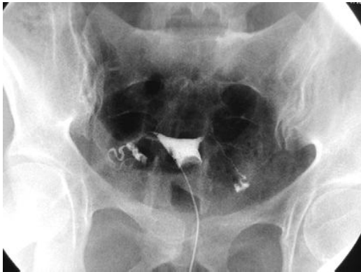
Fig. (5). Bilateral Tubal obstruction.

Among 10% bilateral tubal obstruction (Fig 5), 4% reveal unilateral opening of tube ( Fig 6 ), 3% revealed bilateral opening of the tubes and remaining 3% remained with bilateral tubal obstruction even with our modified technique.