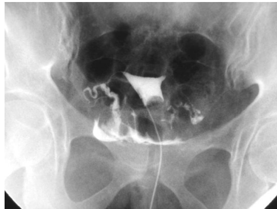
Fig. (2). Unilateral tubal obstruction.