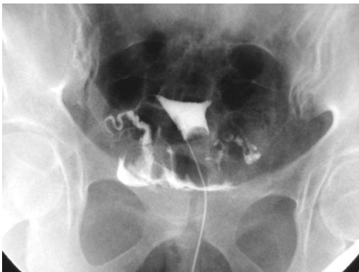
Fig. (6). Right fallopian tube opened after the application of hydrostatic pressure during