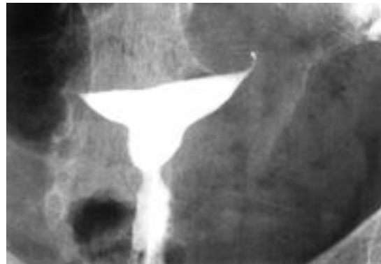
Fig. (3). Bilateral tubal obstruction.

Among 33 unilateral tubal obstruction, 15 tubes (46%) opened after the application of modified technique (Fig. 4), 2 tubes (6%) revealed hydrosalpinx and remained obstructed throughout the examination, 3 tubes (9%) revealed beaded appearance of the tube suggesting TB and remained closed. 13 (39 %) tubes did not showed any obstructed pathology on the HSG examination and attempts of modified technique failed to open the tubes.